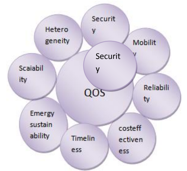
Figure III: Quality of Services(QoS) attributes 3.1.3 Price assisted res/rep management:

A single OoS request of customers, Harmony allows a client to implement resource selection with joint consideration of various QoS requests, such as reputation, efficiency, distance, and price, with different priorities. The difficult is how to consider different or combined QoS attribute, and a customer's most wanted priority of the attributes in provider collection. Harmony solves the problem by joining all attribute values and a client's considered attribute priority into an overall QoS metric. Similarly, Harmony develops a list of QoS attributes. It involves nodes to give evaluations for each QoS element and overall QoS for a source package in addition to the repute for a server. As the reputation response, the QoS ratings are also collected at the directory node of the only if resource of the server. The overall QoS is actually a result of the joint power from the QoS elements. However, it is not easy to identify how the changed features impact the overall OoS. Harmony depends on a neural network to find out the stimulus load of each attribute on the overall OoS value, and further considers users' attribute respect priority. A neural network can be used to derive meaning from complex data, extract forms and detect trends